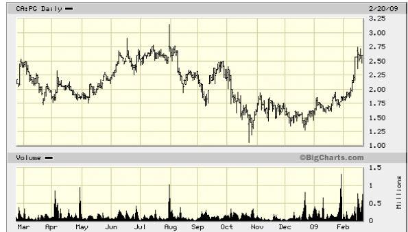
PREMIER GOLD (PG) MARKET CAP $203 MILLION