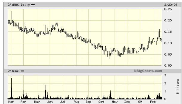
ROXMARK MINES (RMK) MARKET CAP $12 MILLION