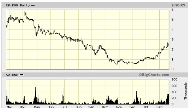
KEEGAN RESOURCES (KGN) MARKET CAP $72 MILLION