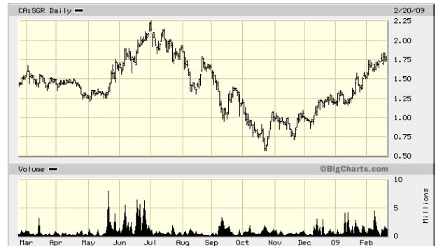
SAN GOLD (SGR) MARKET CAP $413 MILLION