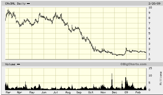
DENISON MINES (DML) MARKET CAP $284 MILLION