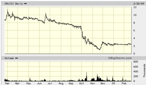
IMPERIAL METALS (III) MARKET CAP $80 MILLION