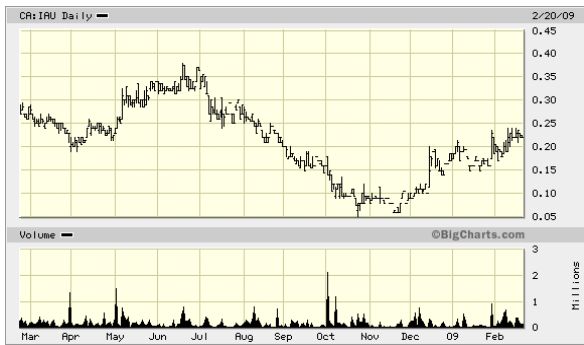
INTREPID MINES (IAU) MARKET CAP $91.3 MILLION