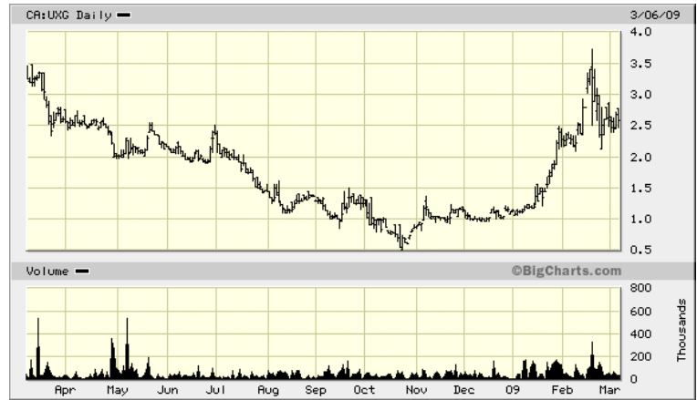
US GOLD (UXG) MARKET CAP $204 MM