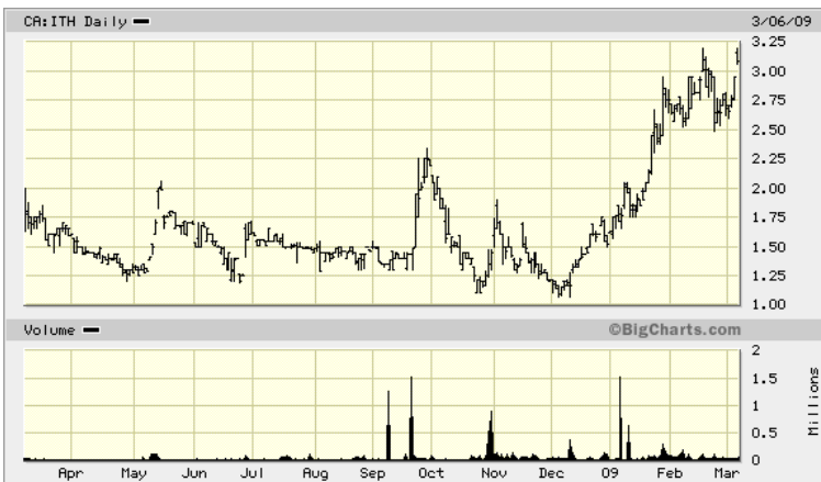
INTERNATIONAL TOWER HILL (ITH) MARKET CAP $136 MM