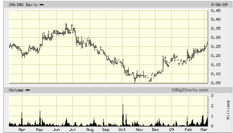
INTREPID MINES (IAU) MARKET CAP $114 MM