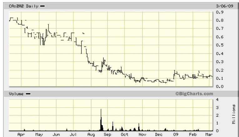
ZAZU METALS (ZAZ) MARKET CAP $3.8 MM