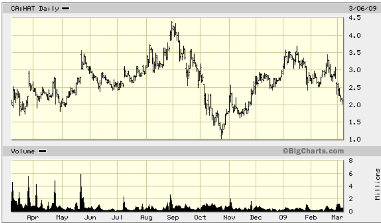
HATHOR EXPLORATION (HAT) MARKET CAP $182 MM