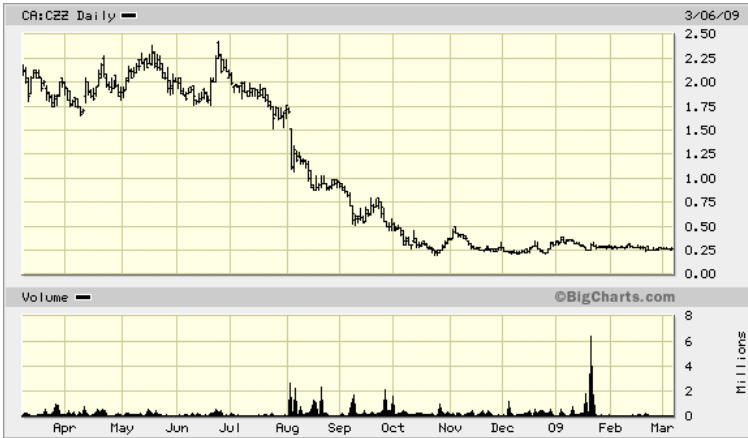
CANADIAN ROYALTIES (CZZ) MARKET CAP $26.5 MILLION