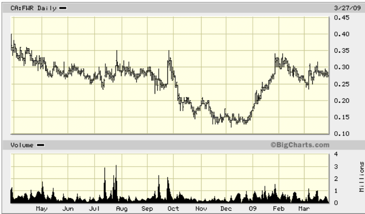
FREEWEST RESOURCES (FWR) MARKET CAP $54 MM