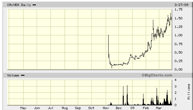
VENTANA GOLD (VEN) MARKET CAP $112 MM