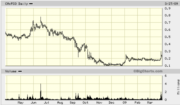
FORMATION CAPITAL (FCO) MARKET CAP $48 MM