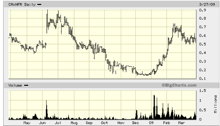
NORTHERN FREEGOLD (NFR) MARKET CAP $46 MM