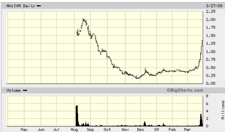
IVANHOE AUSTRALIA (ASX:IVA) MARKET CAP $421 MM