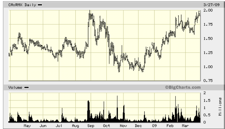
RUBICON MINERALS (RMX) MARKET CAP $345 MM