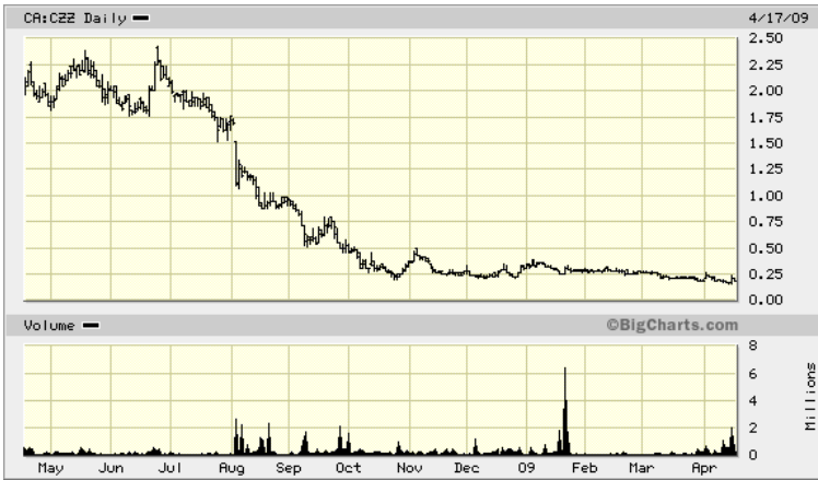
CANADIAN ROYALTIES (CZZ) MARKET CAP $19 MM