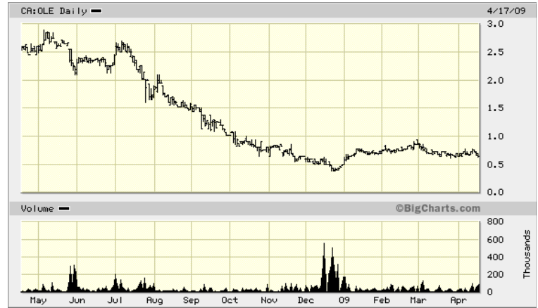
OROMIN EXPLORATION (OLE) MARKET CAP $42 MM