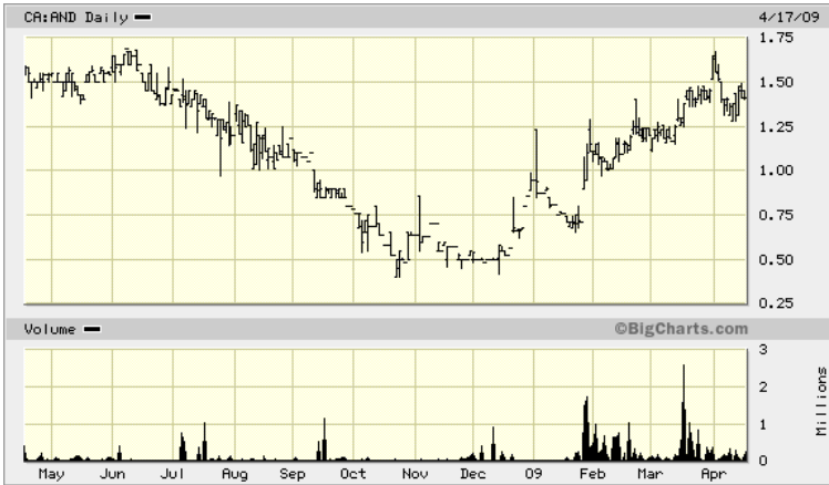
ANDEAN RESOURCES (AND) MARKET CAP $567 MM