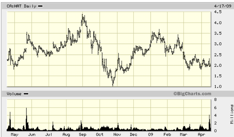
HATHOR EXPLORATION (HAT) MARKET CAP $171 MM