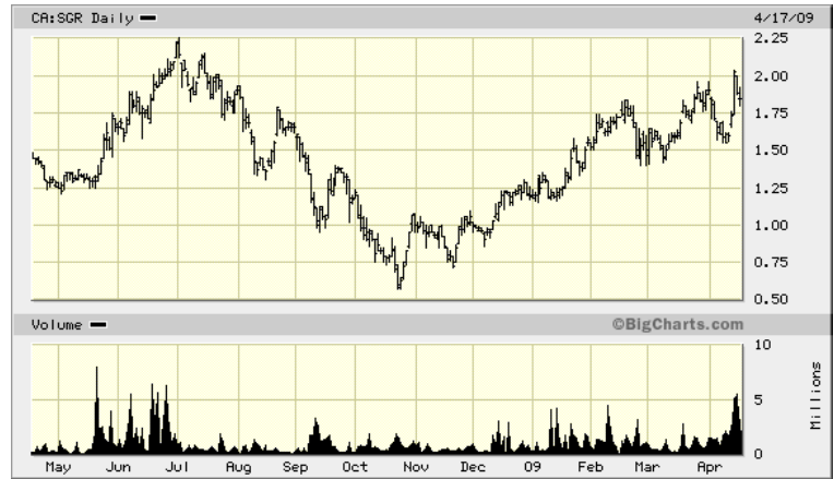
SAN GOLD (SGR) MARKET CAP $438 MM