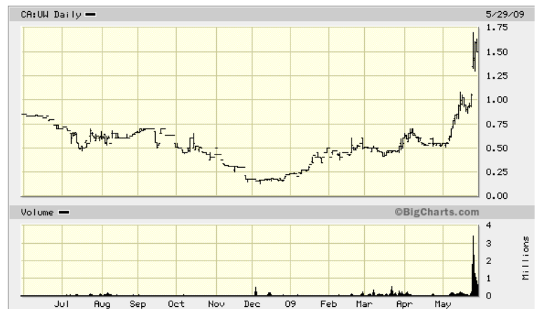
UNDERWORLD RESOURCES (UW) MARKET CAP $37 MM