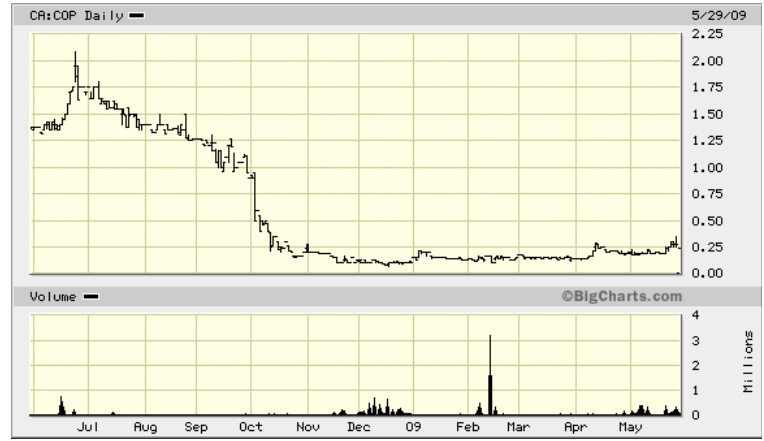
CORO MINING (COP) MARKET CAP $19 MM