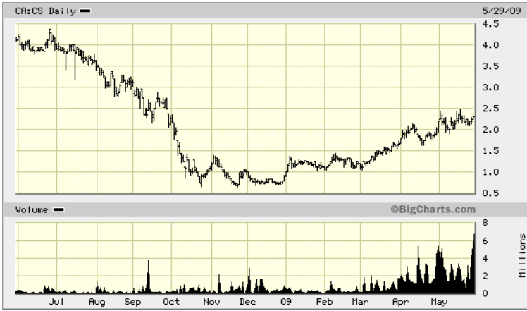
CAPSTONE (CS) MARKET CAP $455 MM