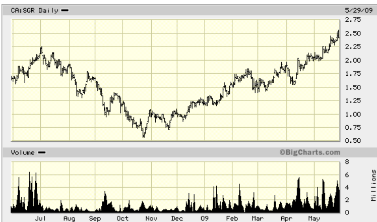
SAN GOLD (SGR) MARKET CAP $579 MM