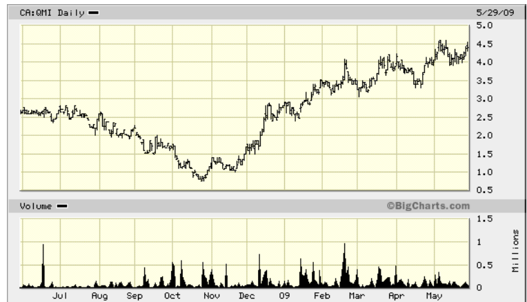
QUEENSTON MINING (QMI) MARKET CAP $253 MM