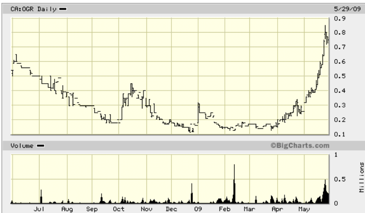
ORO GOLD (OGR) MARKET CAP $17 MM